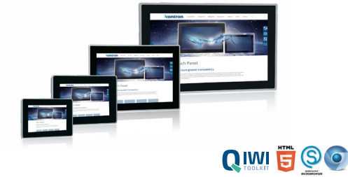
WP Web Panel