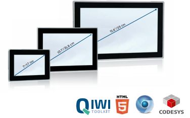
CP Control Panel